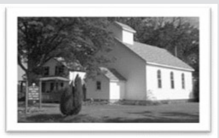
Star of the Sea